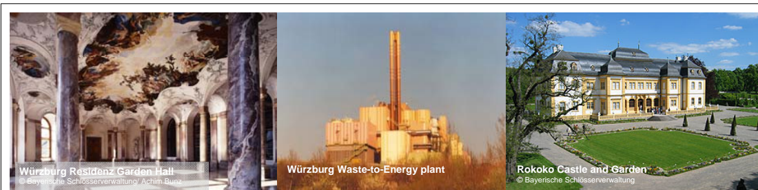
Würzburg Residenz Garden Hall