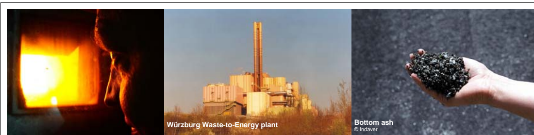
Würzburg Waste-to-Energy plant