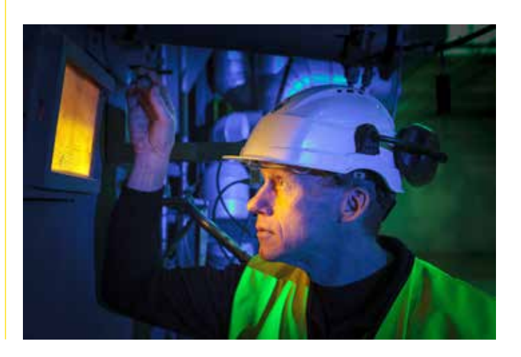
Filborna plant, Sweden

This is the equivalent to the entire population of Sweden, Lithuania and Latvia that can be supplied with electricity and heat throughout the year.